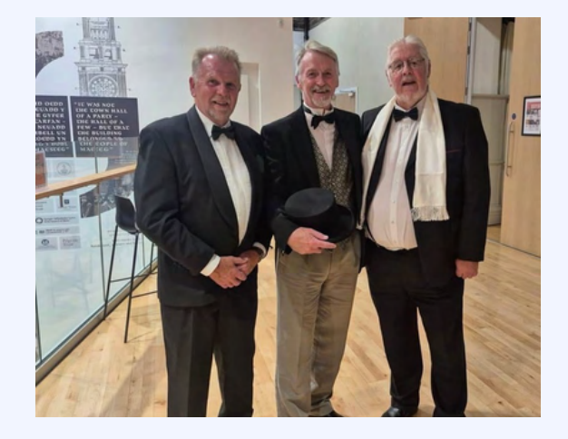
"Our multi-million pound investment in the much-loved Maesteg Town Hall means it will serve the community for generations to come!"