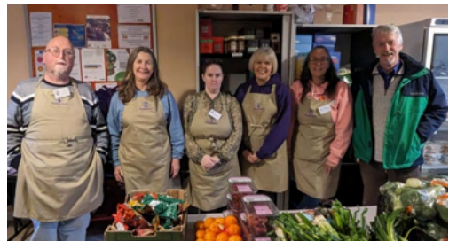
Lending a hand at Baobab Bach CIC food pantry in Lewistown