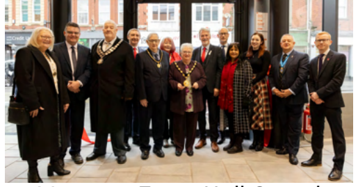
Maesteg Town Hall Grand Opening