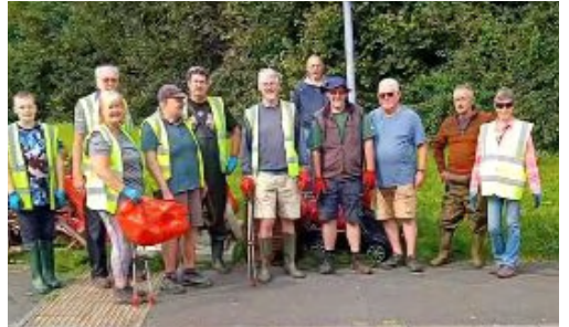
Another morning session with the Llynfi Valley River Care Group