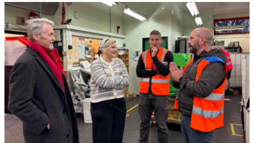
Christmas visit to thank Pontyclun's Royal Mail Postal Workers