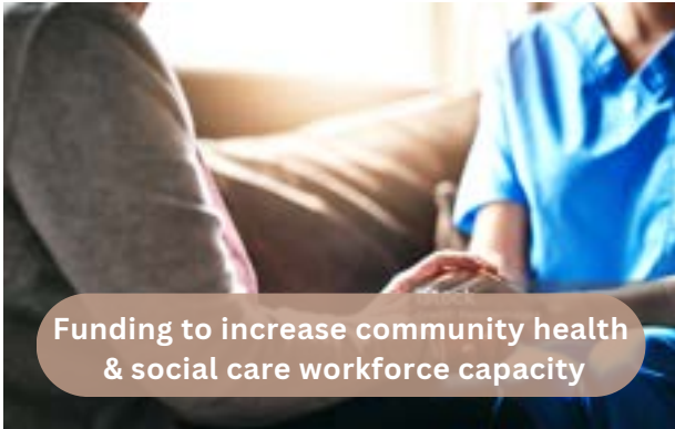
Funding to increase community health & social care workforce capacity

Despite the extreme financial pressures on public services, the Welsh Government has held back an extra £8 million for community care this winter to support people to stay well at home and reduce pressure on hospitals.