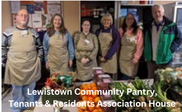
Lewistown Community Pantry, Tenants & Residents Association House

My thanks to the amazing team at Baobab Bach CIC food pantry in Lewistown, Ogmore Valley for letting me help out during one of their sessions.